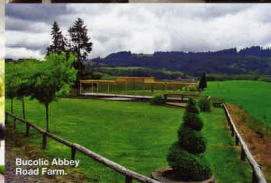
Bucolic Abbey Road Farm.