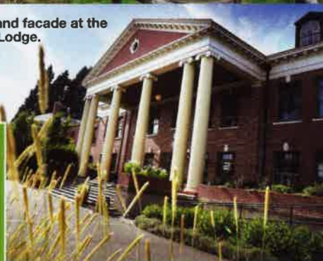
The grand facade at the Grand Lodge.

grand custom walnut table and peekaboo window into the kitchen, is a good option for rehearsal dinners or more intimate parties. Guest rooms, which showcase an autumnal color palette, are equipped with gas fireplaces and private balconies that are perfect for sunset viewing (site fees start at $4,000; food and beverage minimums are $155 per person or $15,500; theallison.com ).