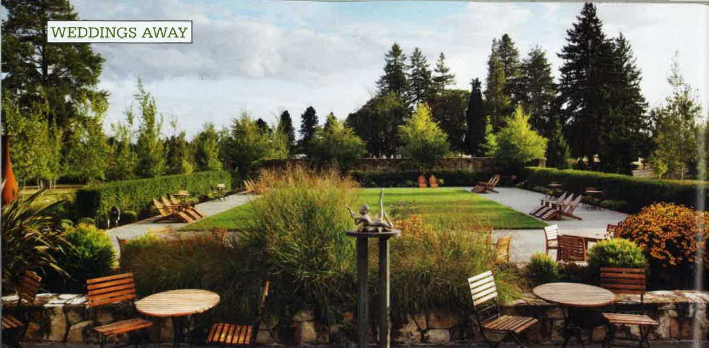
The Allison Inn &amp; Spa.