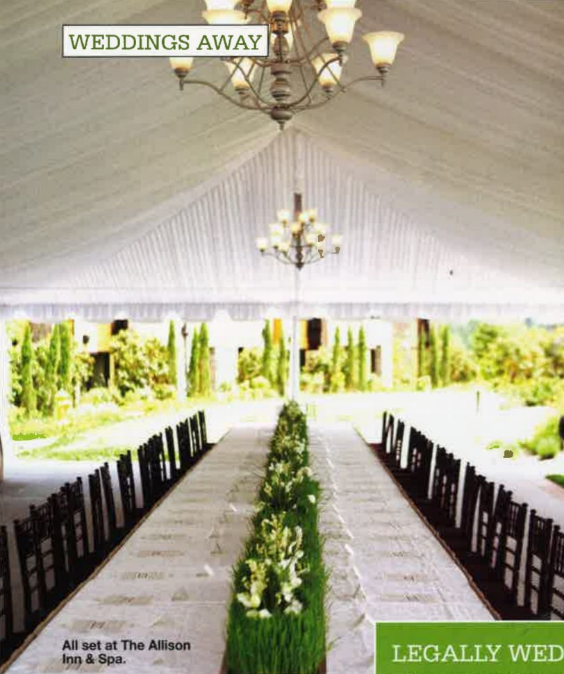
All set at The Allison Inn & Spa.