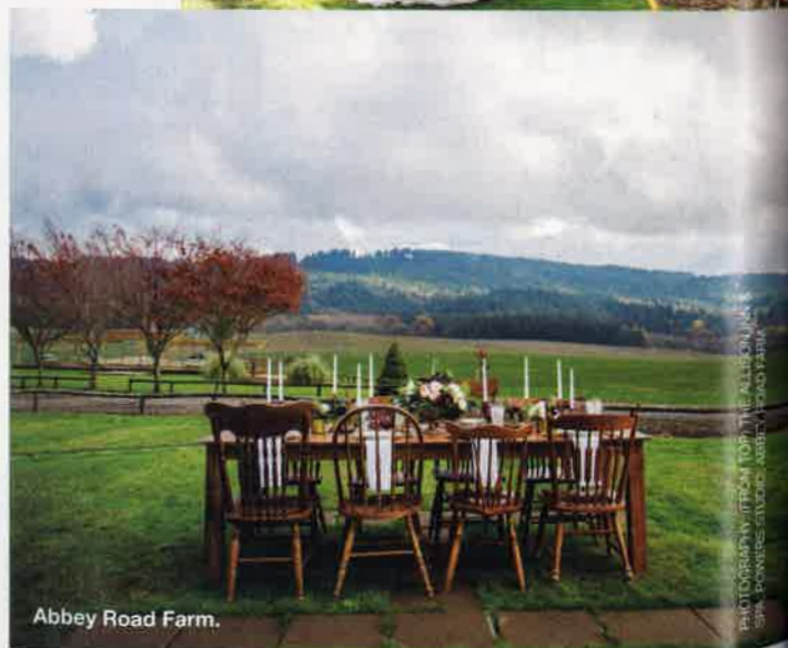
Abbey Road Farm.

Set on 35 hillside acres, this 85-room hotel is the ideal blend of laid-back and luxurious. Settle pre-wedding jitters with private yoga, light bites and massages in the Sky Suite of the 15,000 square-foot spa, which also houses a full-time makeup and nail salon to prep your big-day look. Then it's off to the on-property vineyards, used to make two house vintages, for a stunning first-look backdrop. While the sculpture garden is a fun place for photos, the lush Meadow Garden is an equally photogenic ceremony setting. It, like the ballroom, can seat 150 guests. Sip cocktails with herbs from the impressive acre-and-a-half chef's garden and honey from on-site hives while snacking on cucumber-ginger oyster shooters and savoring the valley view from the terrace. Like Jory, the signature restaurant named after the region's characteristic terroir, the catering menus highlight local purveyors, fresh products (hazelnut anything is a must here) and refined recipes like seafood saffron risotto with melted leeks and chervil. The private dining room, with its →