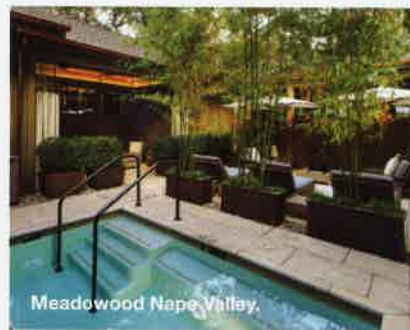
Meadowood Napa Valley.