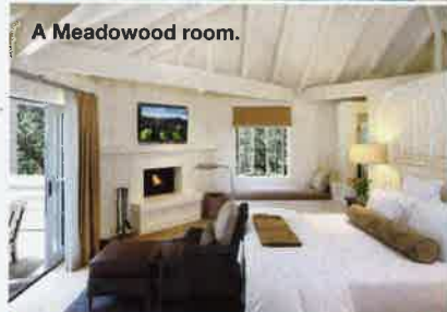
A Meadowood room.