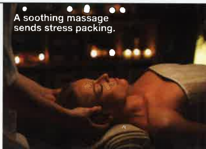
A soothing massage sends stress packing.

Channel your inner RHOBH and repose in a bath of chardonnay. OK, the treatments at this beautiful resort spa aren't exactly bubbling wine baths, but they are indulgent and feature the curative properties of the white grape and do come accompanied by a glass of the house Stone Tower Wild Boar wine. The signature chardonnay massage utilizes the grapes's antioxidants and B vitamins to rejuvenate skin. The wrap experience includes a dry-brushing to stimulate lymphatic drainage and an application of humectant shea butter with chardonnay extract. Located in Leesburg, Virginia on the mighty Potomac River, the picturesque property also includes a comprehensive golf program, hiking and biking trails, award-winning cuisine and 296 guest accommodations (room rates start at $269 a night; destinationhotels.com ).