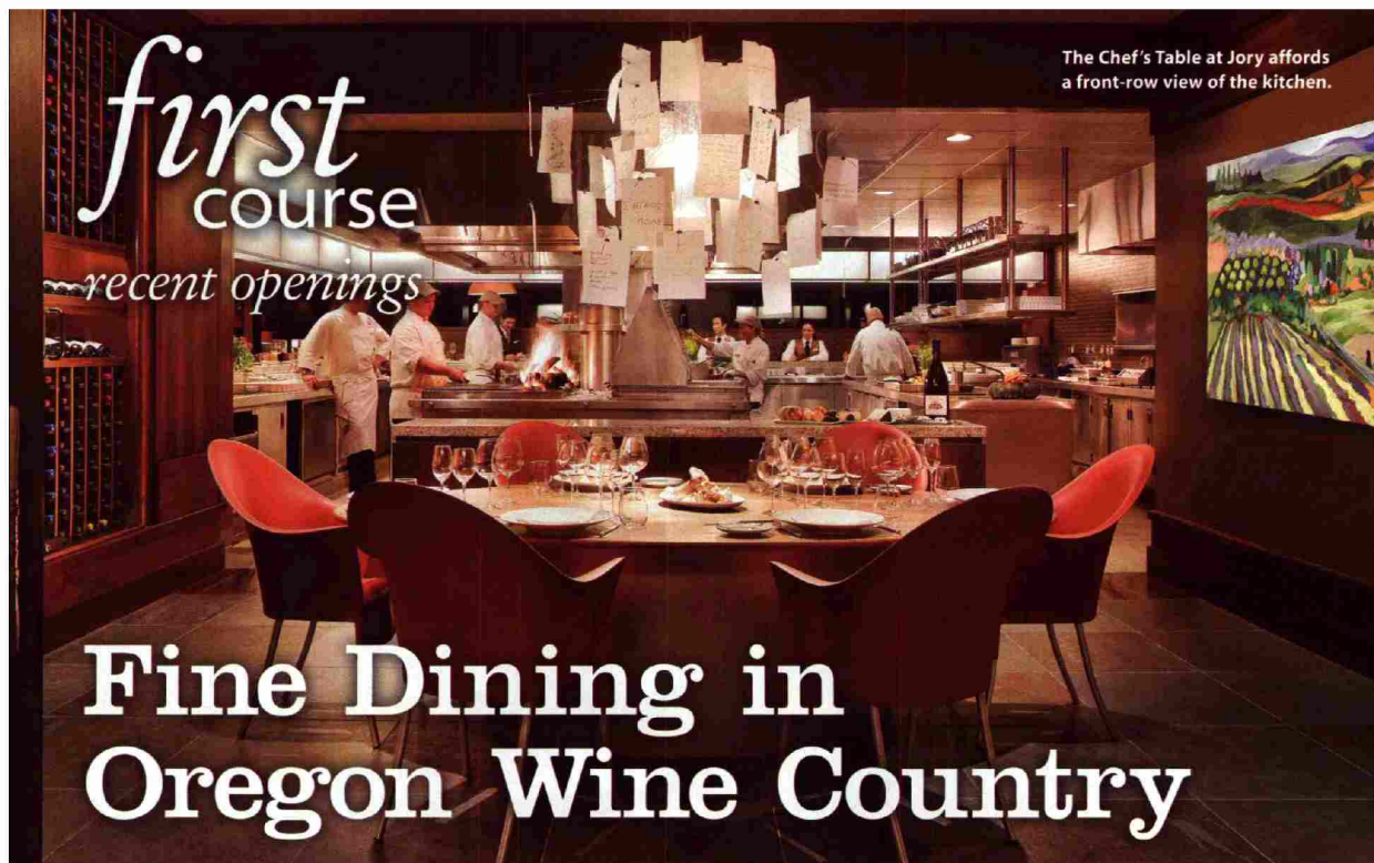
The Chef's Table at Jory affords a front-row view of the kitchen.